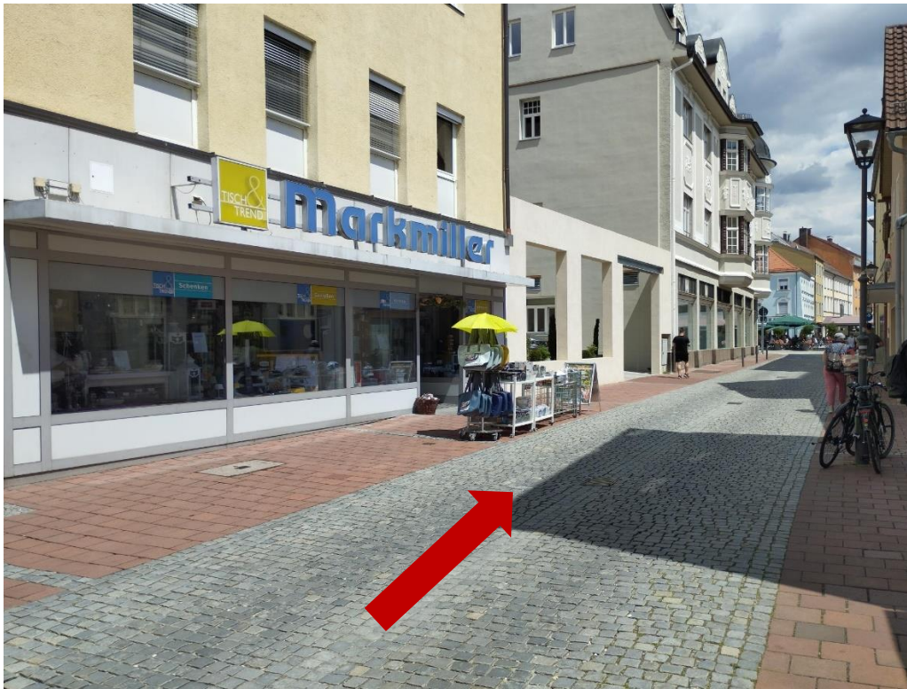
Eingang Rückseite Fielmann